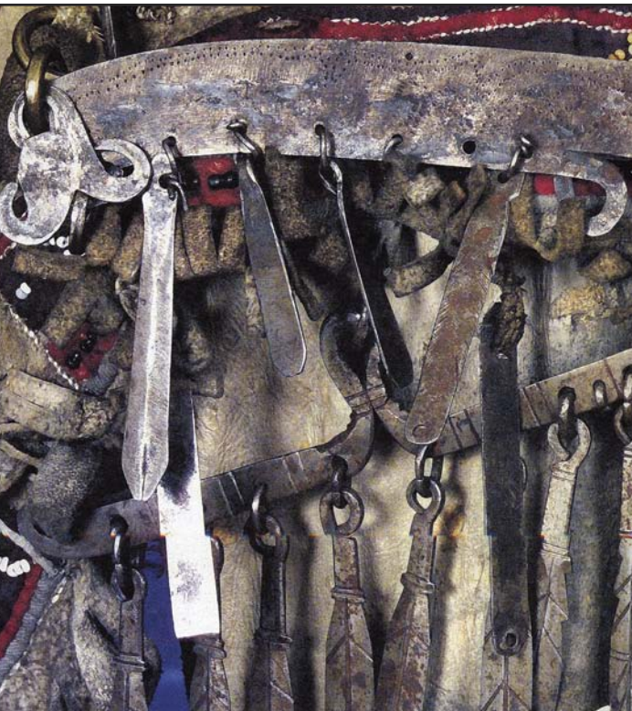
Below: iron objects on the coat of a Buryat or Evenk shaman Late C19th

tools and weapons, being honoured for their work and their skill.