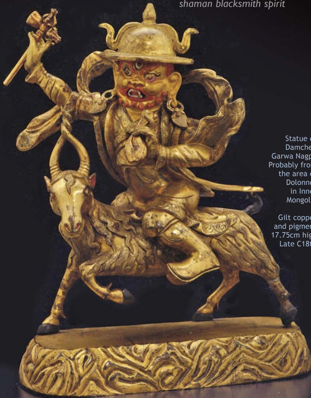
Statue of Damchen Garwa Nagpo Probably from the area of Dolonnor in Inner Mongolia

An introduction to Damjin Dorlig, the Southern Siberian and Central Asian shaman blacksmith spirit