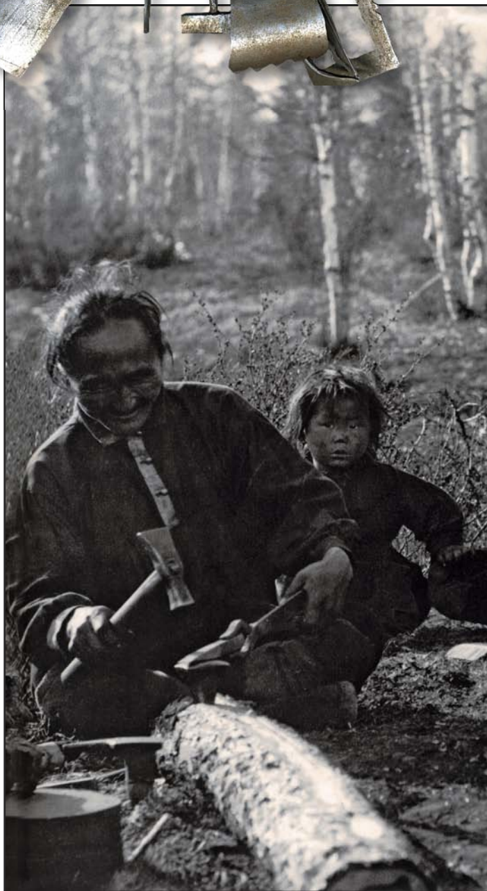
Below: Evenk blacksmith making metal items for a shaman Photo 1908