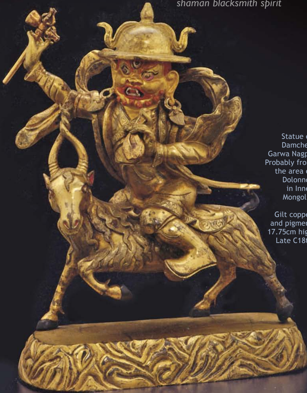
Statue of Damchen Garwa Nagpo Probably from the area of Dolonnor in Inner Mongolia

An introduction to Damjin Dorlig, the Southern Siberian and Central Asian shaman blacksmith spirit