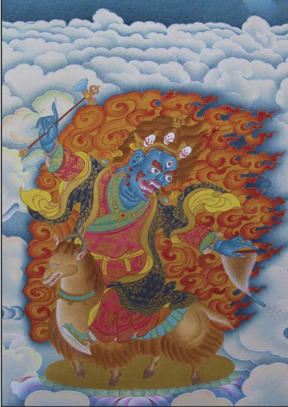
Above: Tibetan thangka painting of Damchen Garwa Nagpo