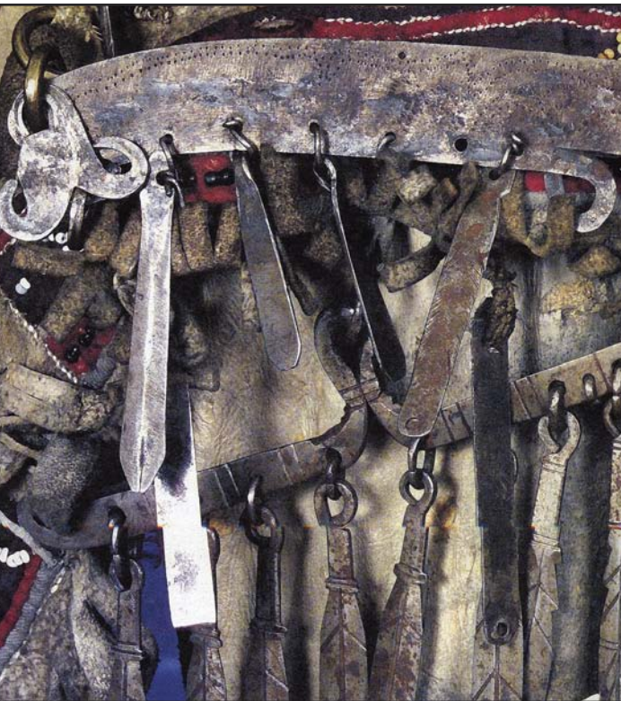
Below: iron objects on the coat of a Buryat or Evenk shaman Late C19th

tools and weapons, being honoured for their work and their skill.